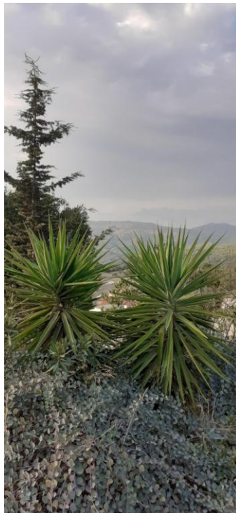
View from the church