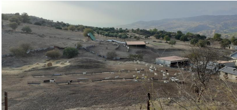
Goat farm where the old village used to be