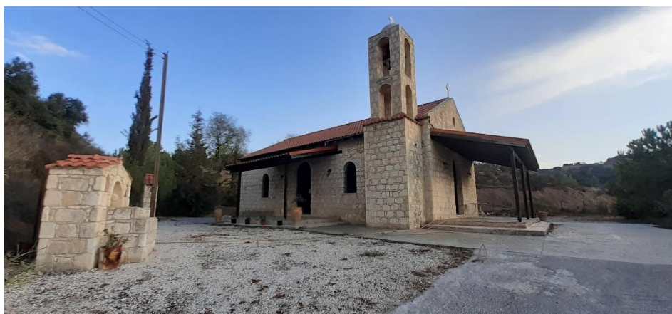
Agios Zenonas church